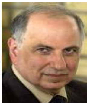
Ahmad Chalabi '69