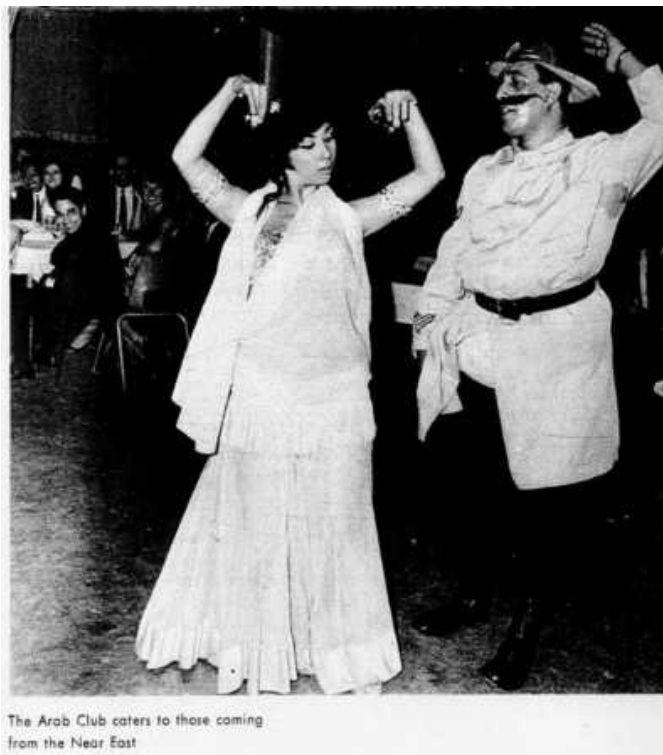
Bellydancer and Policeman, picture (Technique, 1961)