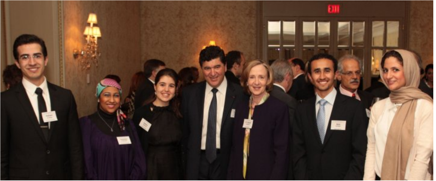
Members of MIT-ASO Executive Committee posing with MIT President, Susan Hockfield and Elias Zerhouni, Former Director of the National Institute of Health (NIH), during SciTech Awards Banquet, April 2010.